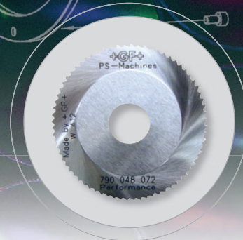
Saw blades for optimal cutting results and long tool service life. Performance range for high-alloyed steel (stainless steel).