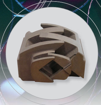
Clamping jaws replacement set for PS 4.5 and PS 6.6 made from coated aluminum-cast. Extension of the dimension of the PS 6.6 up to a OD min. 1.181 inch. Code 790 048 380