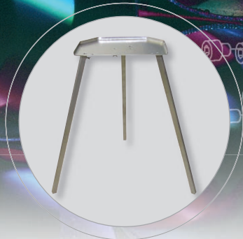
Tripod made of stainless steel. Space saving, fast application, easy handling. Code 790 048 335